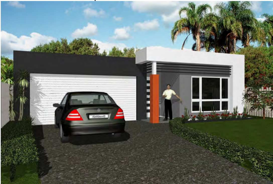
Proposed View from Beechwood Circuit