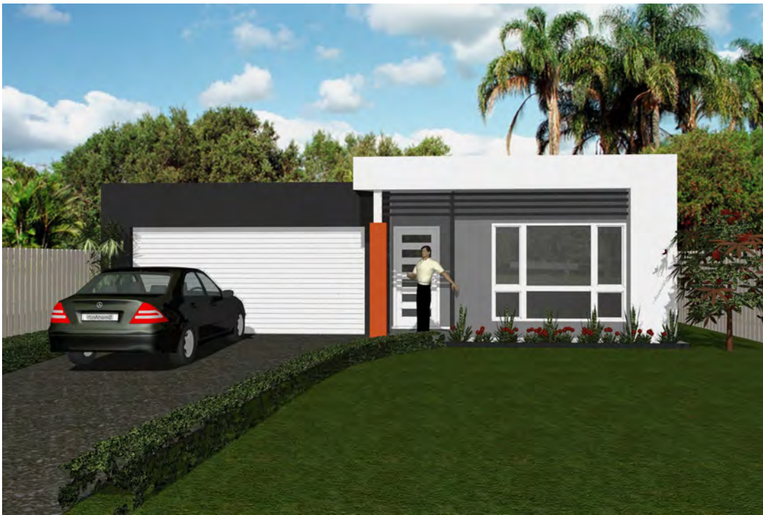
Proposed View from Beechwood Circuit