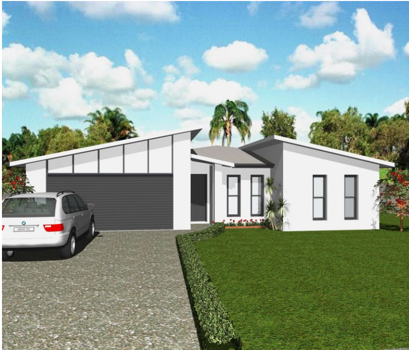
ARTISTS IMPRESSION FROM STREET