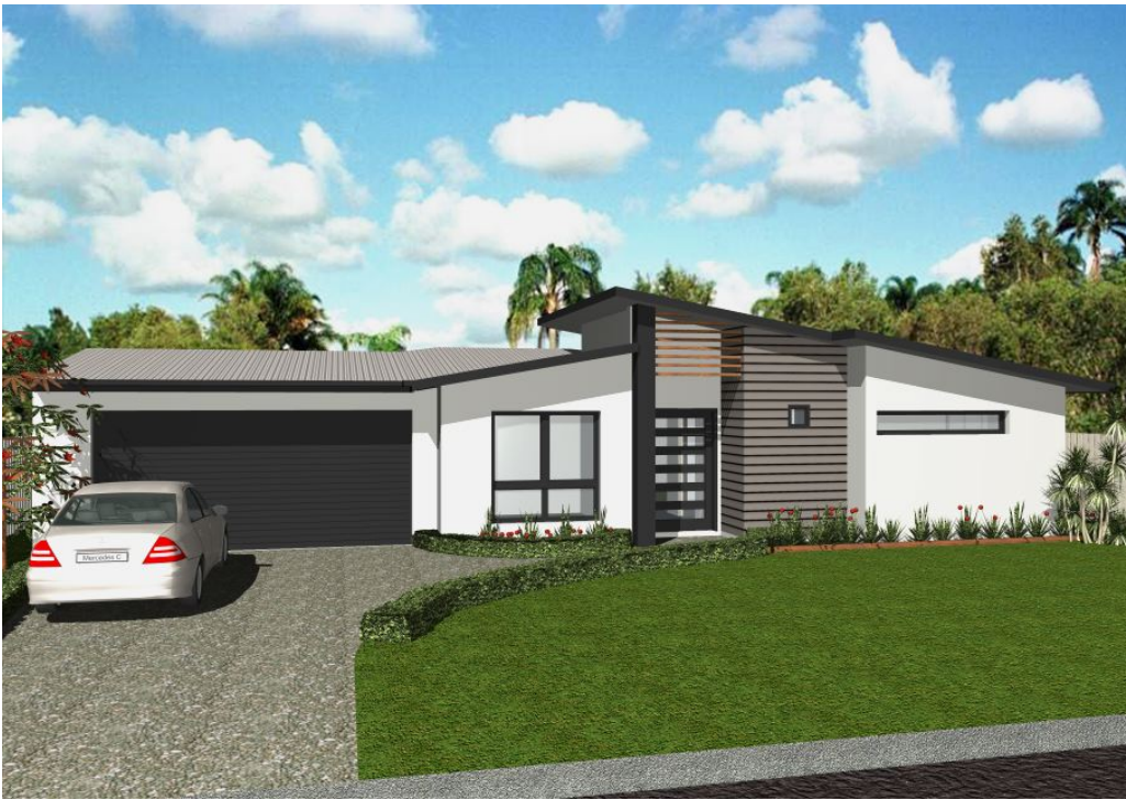
ARTISTS IMPRESSION FROM STREET