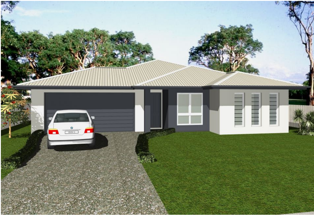
ARTISTS IMPRESSION FROM STREET