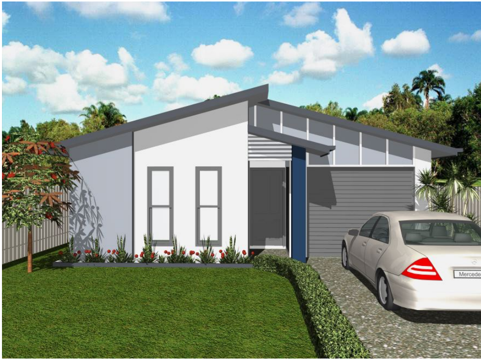
ARTISTS IMPRESSION FROM STREET