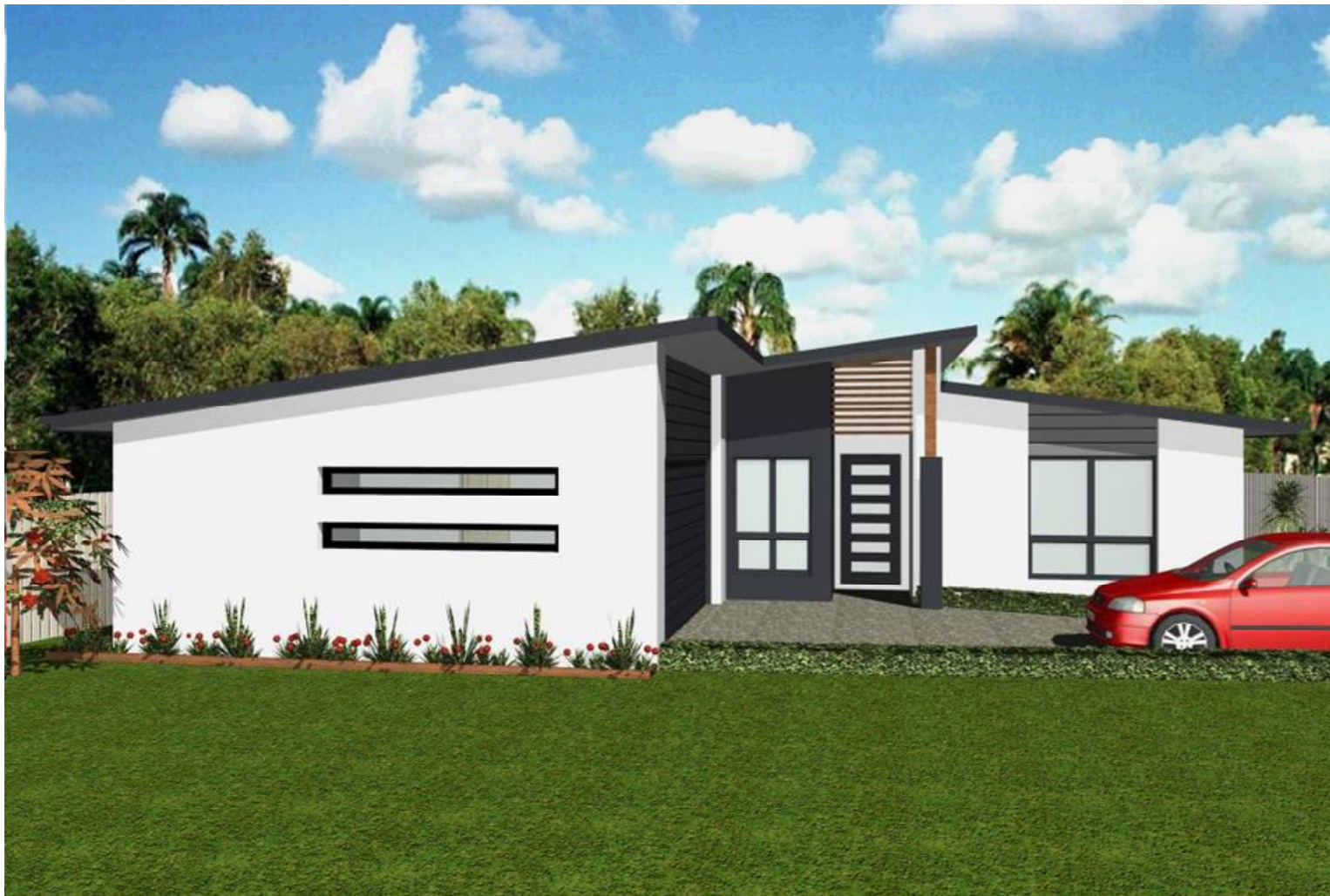
ARTISTS IMPRESSION FROM STREET