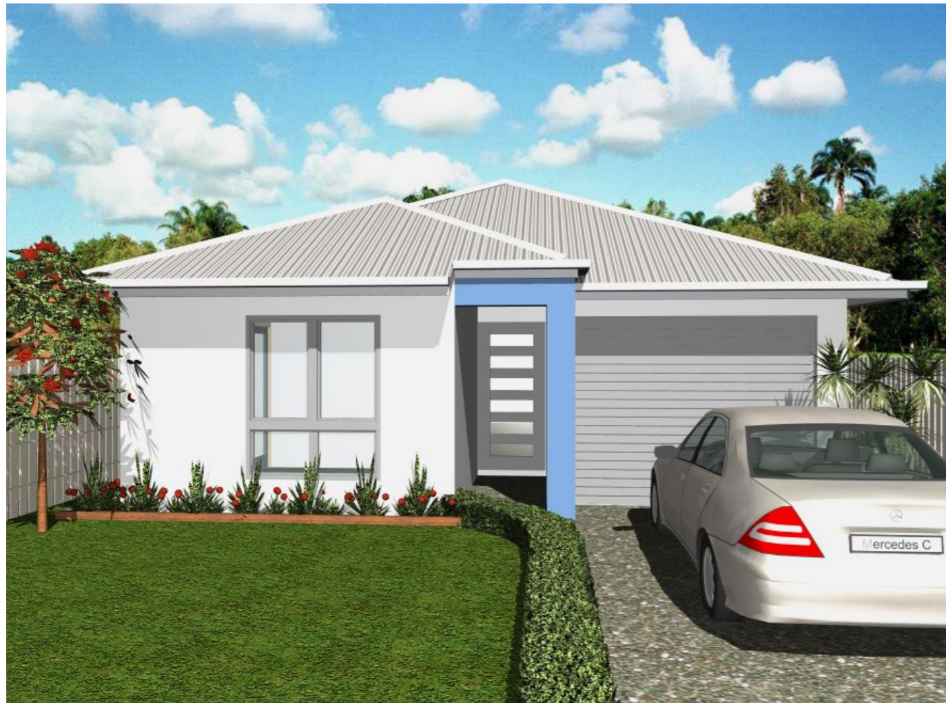
ARTISTS IMPRESSION FROM STREET