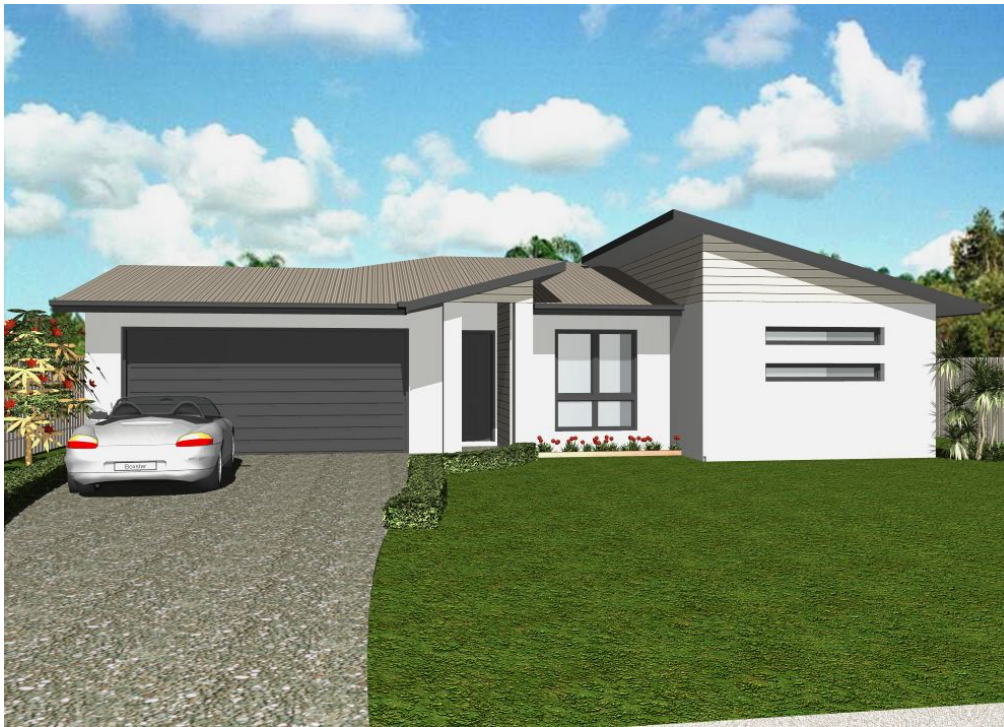
ARTISTS IMPRESSION FROM STREET