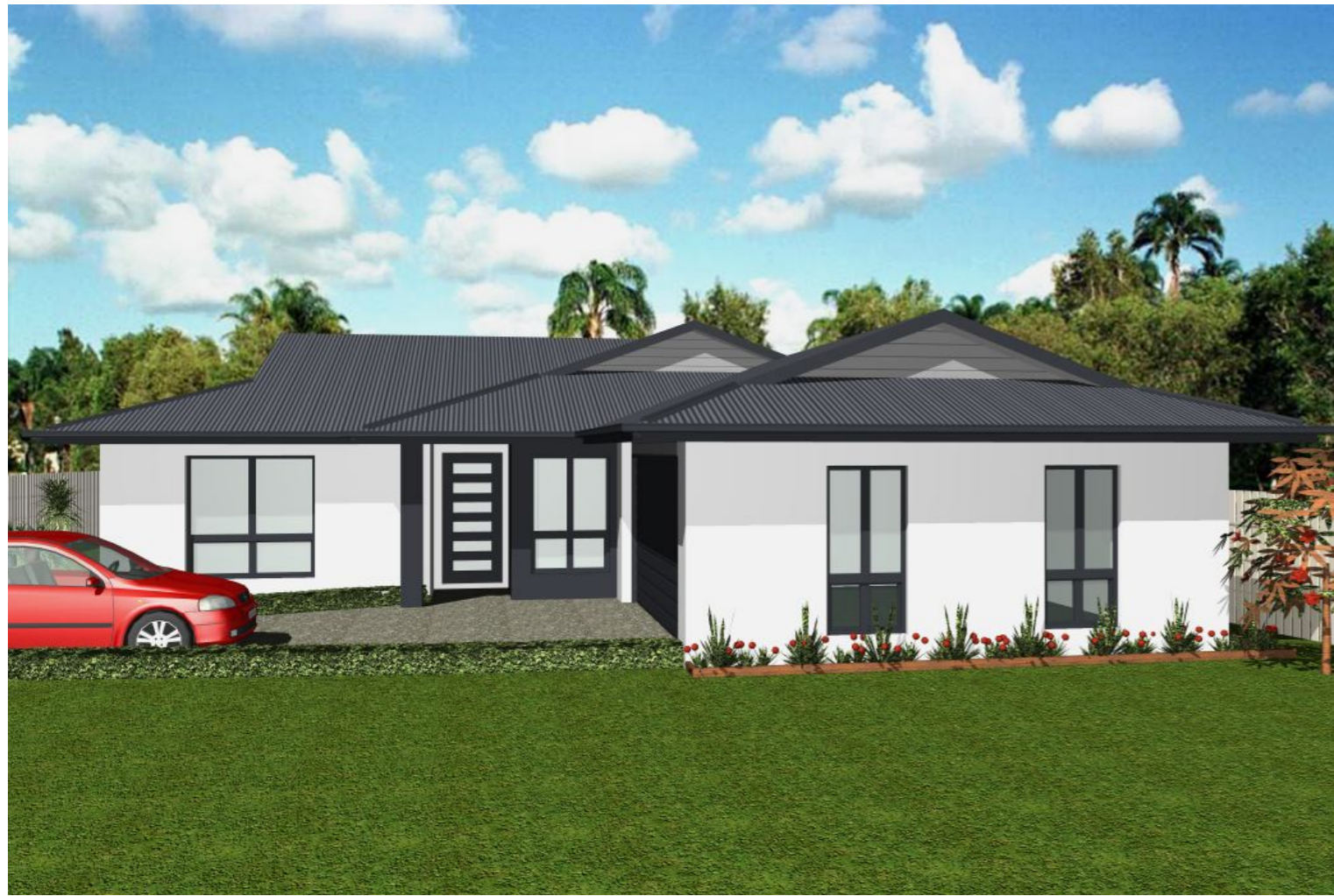
ARTISTS IMPRESSION FROM STREET