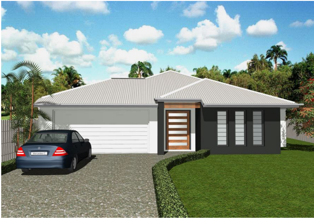
ARTISTS IMPRESSION FROM STREET