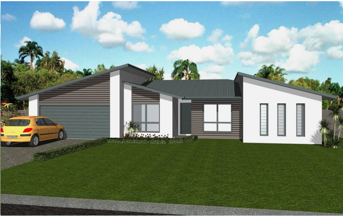
ARTISTS IMPRESSION FROM STREET