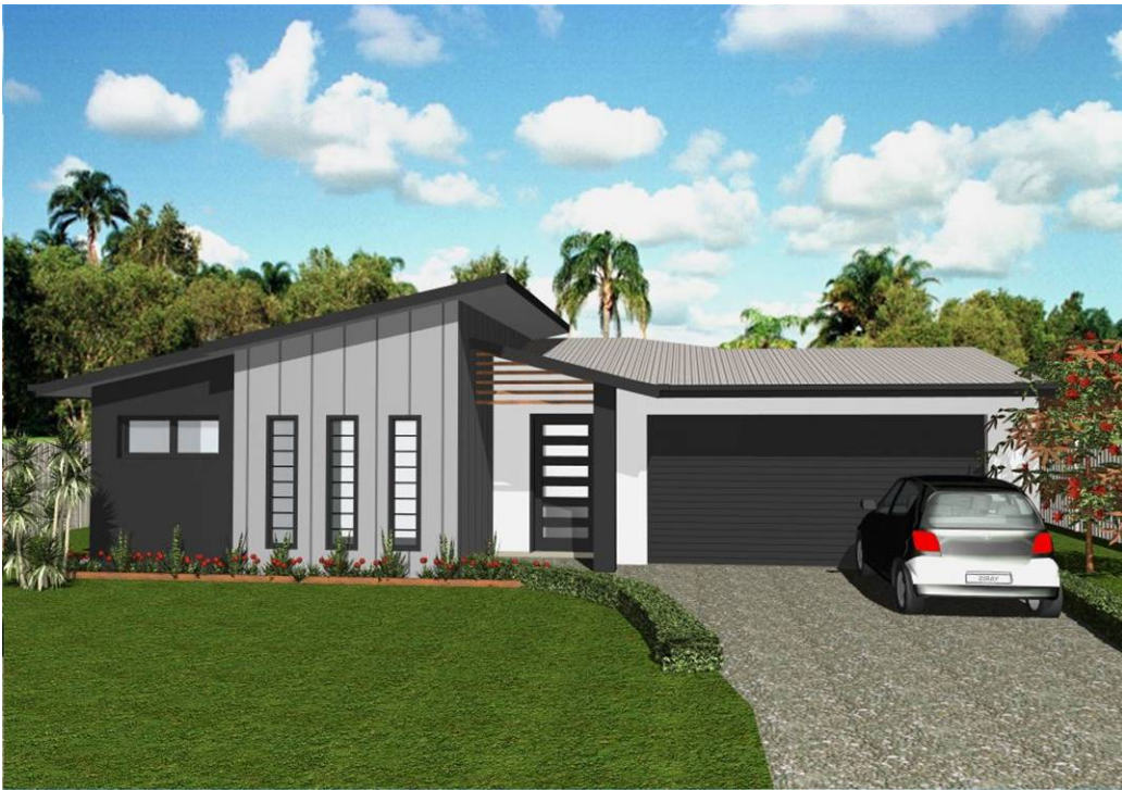
ARTISTS IMPRESSION FROM STREET